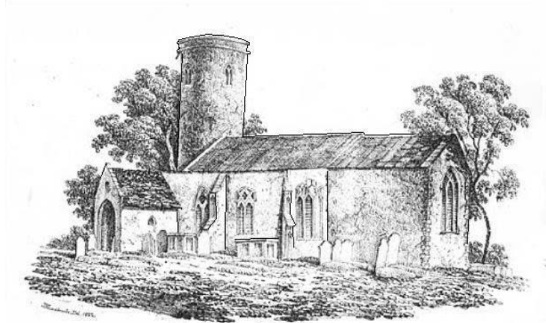
Thwaite Church in 1822